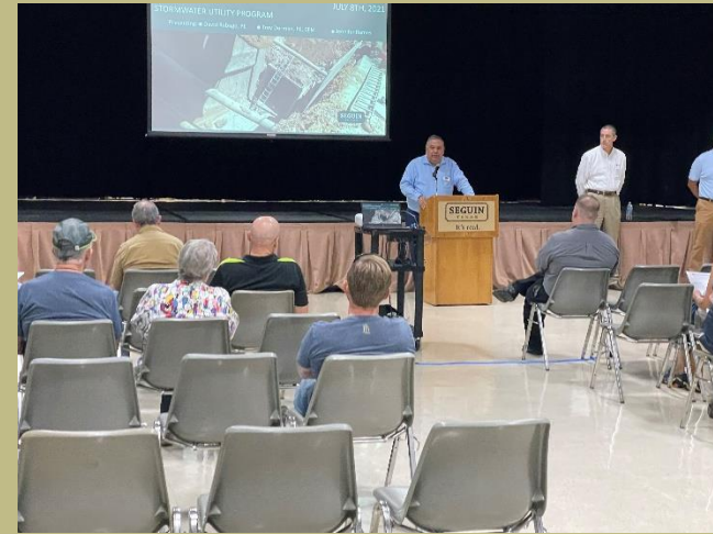
Public meeting July 8, 2021

Majority of residents feel that the City should not exempt any properties: County, municipal, school district, religious, cemeteries