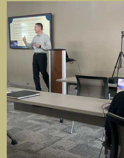
Utility Committee Meeting October 13, 2021