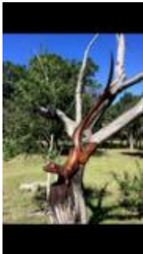
Examples of Artist's Work