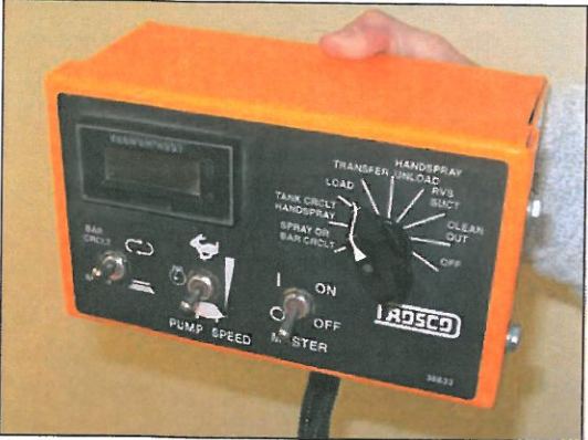
In-cab controller box controls gallons-per-minute, rotary valves, and spraybar on/off/bar circulate from the towing vehicle.

The RMT gives operators truck-mounted, distributor ease of operation and productivity in a trailer-mounted unit.