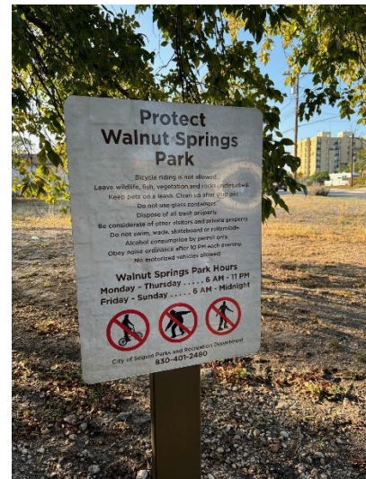
Figure 2: Walnut Springs Park Sign