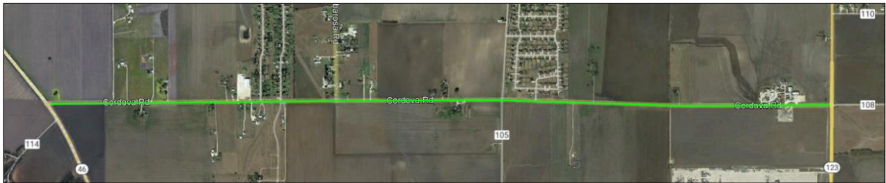
Figure 1. Cordova Road between SH 46 and SH 123.

Cordova Road is a two-lane roadway that connects SH 46 and SH 123 with traffic signals at the intersections with SH 46 and SH 123. Major intersections on Cordova Road include intersections with Barbarossa Road and Huber Road, which are both stop controlled on the minor streets.