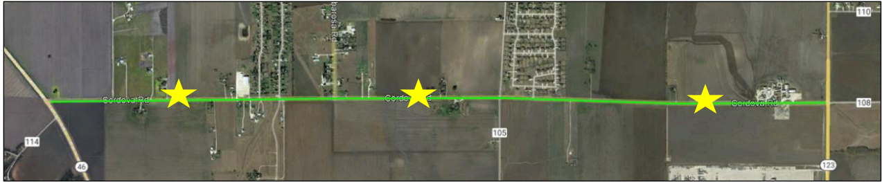
Figure 4. Cordova Road data collection locations.

Traffic speed and volume data were collected on February 1 and 16, 2022 in three locations on Cordova Road, shown in Figure 3. All data was collected at points within the existing posted 50 mph speed limit. The results of these studies are shown in Table 1 below.