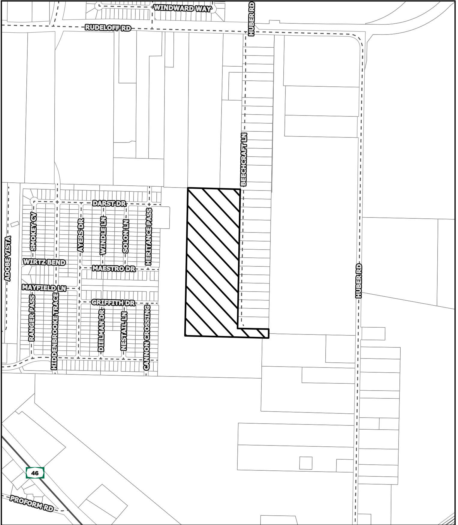
GLUP 01-26/ZC 04-26 South of Beechcraft Ln & Rudeloff Rd. (Property ID: 52966)

This map is for information purposes and may not have been prepared for or be suitable for legal, engineering, or surveying purposes. It does not represent an on-the-ground survey and represents only the approximate relative location of property boundaries. The City of Seguin assumes no liability for errors on this map or use of this information.