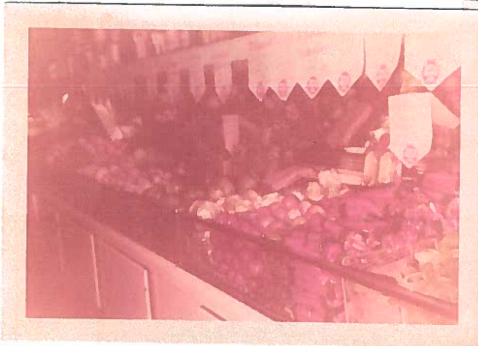
VEGETABLE SECTION - NAUMANN'S REAR WHIP