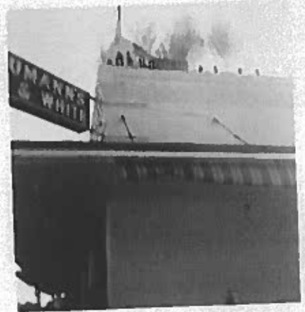
CHURCH ON TOP OF STORE AT CHRISTMAS PLAYING CARDS