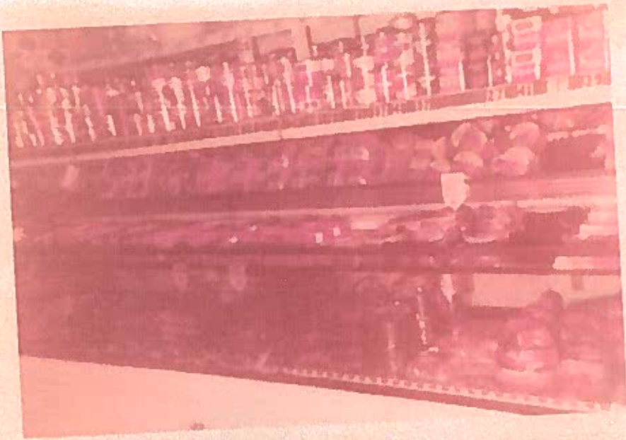
NAUMANN RED & WHITE 1956