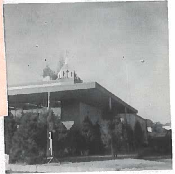
CHURCH ON TOP OF NEW STORE AT CHRISTMAS