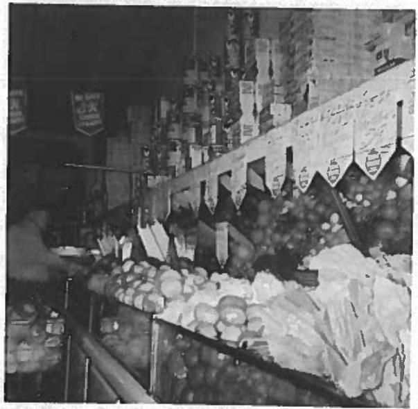
PRODUCE SECTION NAUMANN'S RED + WHITE