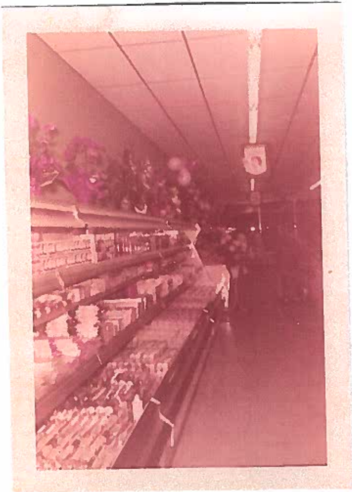
DAIRY SECTION NAUMANN'S SUPER MARKET GRAND OPENING 1958