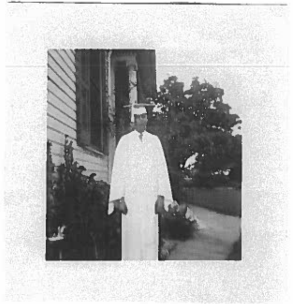
STARLEY 181A HIGH SCHOOL GRADUATE