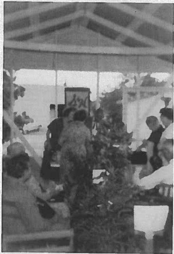
CARL POOL FLOWER CLINIC NAUMANN NURSERY 1960