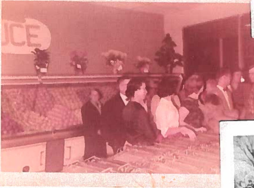
GRAND OPENING - NAUMANN'S SUPER MARKET