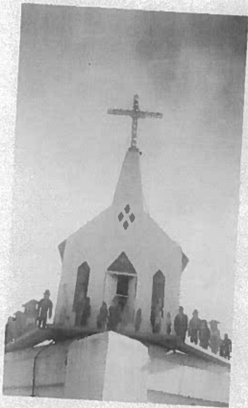
CHURCH ON TOP OF NAUMANN'S RED + WHITE AT CHRISTMAS TIME. PLAYED CHRISTMAS MUSIC