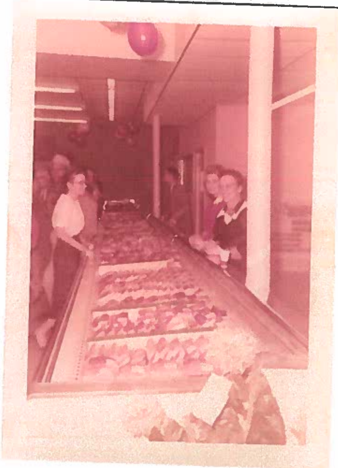
NAUMANN'S SUPER MKT. MEAT SECTION