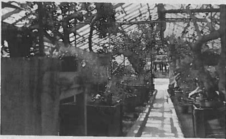
NAUMANN NURSERY 410 N. CAMP