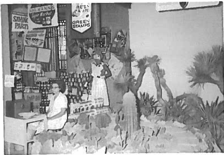
NURSERY DISPLAY - GUADALUPE COUNTY FAIR 1964 ELSIE in BOOTH