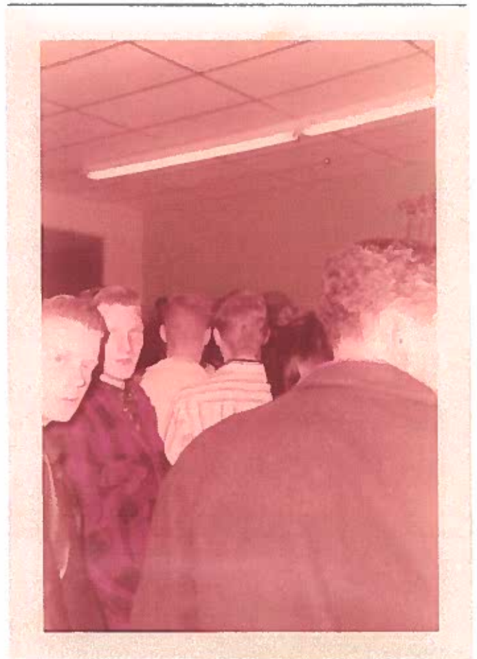
PEOPLE AT GRAND OPENING NAUMANN'S SUPER MARKET 1958