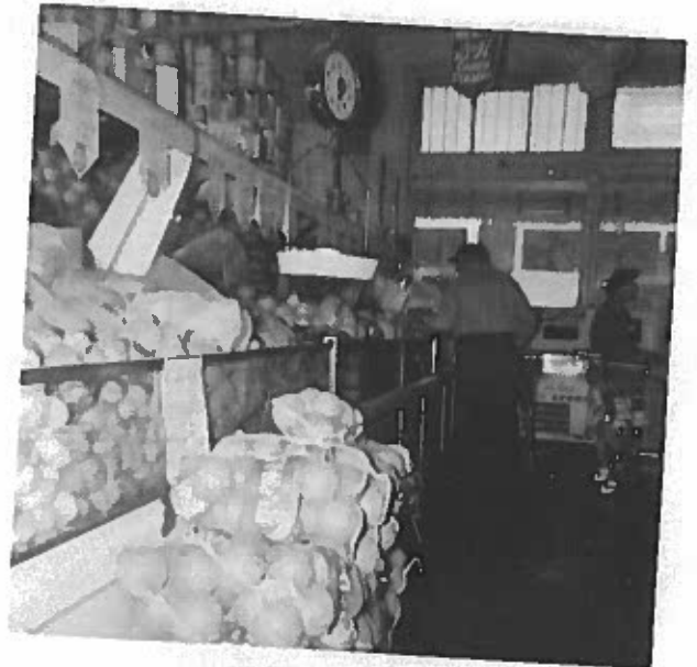
NAUMANN RED + WHITE GONZALES ST.